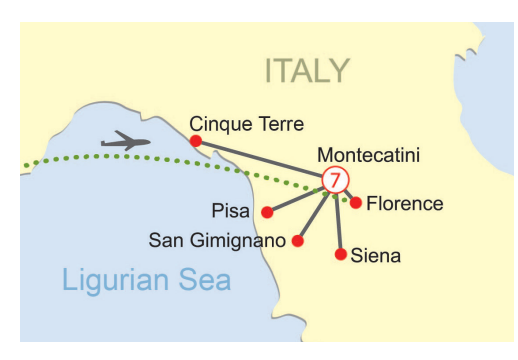
· · · · · Flight Motorcoach